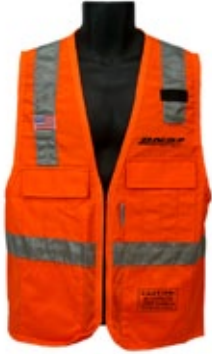
CLASS II FABRIC UPPER / MESH LOWER FRONT – ALL-MESH BACK VESTS ZIPPER CLOSURE ANSI / ISEA (107-2004) ANSI CLASS II SAFETY VEST; FABRIC UPPER / MESH LOWER FRONT - ALL-MESH BACK, NFPA 701 *