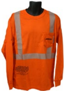
CLASS II 6OZ LIGHT-WEIGHT INDURA ULTRA SOFT JERSEY FR LONG SLEEVE T-SHIRT WITH POCKET ANSI STYLE CLASS II 6OZ LIGHT-WEIGHT INDURA ULTRA SOFT JERSEY FR LONG SLEEVE T-SHIRT WITH POCKET; ASTM F1506 AND NFPA 70E; ORANGE