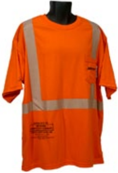
CLASS II 6OZ LIGHT-WEIGHT INDURA ULTRA SOFT JERSEY FR SHORT SLEEVE T-SHIRT WITH POCKET ANSI STYLE CLASS II 6OZ LIGHT-WEIGHT INDURA ULTRA SOFT JERSEY FR SHORT SLEEVE T-SHIRT WITH POCKET; ASTM F1506 AND NFPA 70E; ORANGE