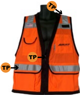
CLASS II 10-POCKET ALL-MESH TEAR-AWAY SURVEYORS VEST ZIPPER CLOSURE WITH MAP POCKET ANSI / ISEA (107-2004) ANSI CLASS II 10-POCKET ALL-MESH TEAR-AWAY SURVEYORS SAFETY VEST WITH MAP POCKET; NFPA 701 *