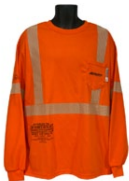
CLASS III 6OZ LIGHT-WEIGHT INDURA SOFT JERSEY FR LONG SLEEVE T-SHIRT WITH POCKET ANSI STYLE CLASS III 6OZ LIGHT-WEIGHT INDURA UKTRA SOFT JERSEY FR LONG SLEEVE T-SHIRT WITH POCKET; ASTM F1506 AND NFPA 70E; ORANGE