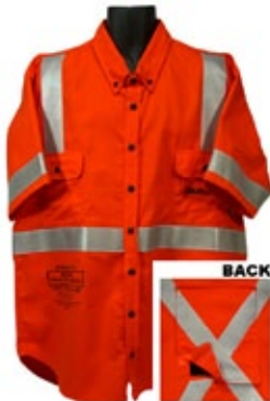
CLASS III 7OZ LIGHT-WEIGHT INDURA ULTRA SOFT FR SHORT SLEEVE BUTTON DOWN WORK SHIRT WITH FALL PROTECTION ANSI STYLE CLASS III 7OZ LIGHT WEIGHT INDURA ULTRA SOFT FR SHORT SLEEVE BUTTON DOWN WORK SHIRT; ASTM F1506 AND NFPA 70E; ORANGE; BUTTON CLOSURE WITH FALL PROTECTION