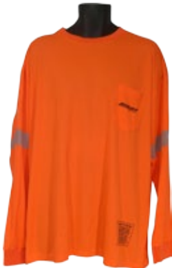
CLASS E 100% POLYESTER STANDARD LONG SLEEVE T-SHIRTS WITH SEGMENTED REFLECTIVE TAPE

ANSI / ISEA (107-2004) ANSI CLASS E 100% POLYESTER STANDARD T-SHIRT, LONG SLEEVES, ORANGE; WITH SEGMENTED REFLECTIVE TRIM; NFPA 701 *