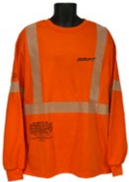
CLASS III 6OZ LIGHT-WEIGHT INDURA SOFT JERSEY FR LONG SLEEVE T-SHIRT WITHOUT POCKET ANSI STYLE CLASS III 6OZ LIGHT-WEIGHT INDURA SOFT JERSEY FR LONG SLEEVE T-SHIRT WITHOUT POCKET; ASTM F1506 AND NFPA 70E; ORANGE