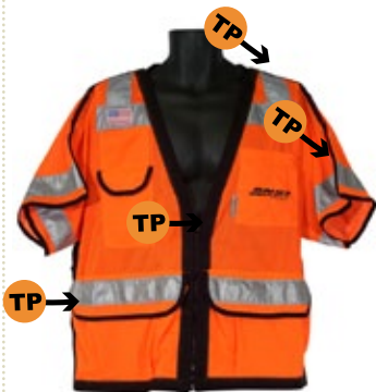
CLASS III 10-POCKET ALL-MESH TEAR-AWAY SURVEYORS VEST ZIPPER CLOSURE WITH MAP POCKET ANSI / ISEA (107-2004) ANSI CLASS III 10-POCKET ALL-MESH TEAR-AWAY SURVEYORS SAFETY VEST WITH MAP POCKET; NFPA 701 *