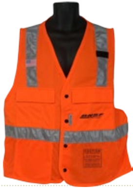
CLASS II FABRIC UPPER / MESH LOWER FRONT – ALL-MESH BACK VESTS SNAP CLOSURE ANSI / ISEA (107-2004) ANSI CLASS II SAFETY VEST; FABRIC UPPER / MESH LOWER FRONT - ALL-MESH BACK, NFPA 701 *