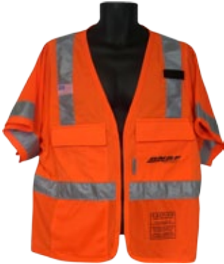
CLASS III FABRIC UPPER / MESH LOWER FRONT ALL-MESH BACK VESTS ZIPPER CLOSURE ANSI / ISEA (107-2004) ANSI CLASS III SAFETY VEST; FABRIC UPPER / MESH LOWER FRONT - ALL-MESH BACK, NFPA 701 *