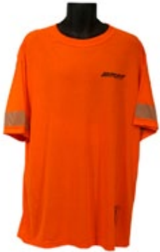
CLASS E 100% POLYESTER STANDARD SHORT SLEEVE T-SHIRTS WITH SEGMENTED REFLECTIVE TAPE ANSI / ISEA (107-2004) ANSI CLASS E 100% POLYESTER STANDARD T-SHIRT, SHORT SLEEVES, ORANGE; WITH SEGMENTED REFLECTIVE TRIM; NFPA 701 *