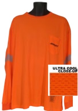
CLASS E 100% POLYESTER ULTRA COOL MESH LONG SLEEVE T-SHIRTS WITH SEGMENTED REFLECTIVE TAPE

ANSI / ISEA (107-2004) ANSI CLASS E 100% POLYESTER ULTRA COOL MESH T-SHIRT, LONG SLEEVES, ORANGE; WITH SEGMENTED REFLECTIVE TRIM; NFPA 701 *