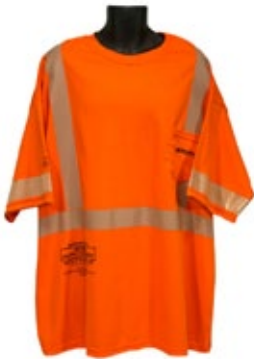
CLASS III 6OZ LIGHT-WEIGHT INDURA SOFT JERSEY FR SHORT SLEEVE T-SHIRT WITH POCKET ANSI STYLE CLASS III 6OZ LIGHT-WEIGHT INDURA SOFT JERSEY FR SHORT SLEEVE T-SHIRT WITH POCKET; ASTM F1506 AND NFPA 70E; ORANGE