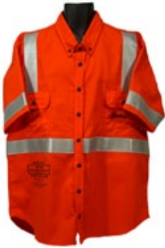
CLASS III 7OZ LIGHT-WEIGHT INDURA ULTRA SOFT FR SHORT SLEEVE BUTTON DOWN WORK SHIRT ANSI STYLE CLASS III 7OZ LIGHT WEIGHT INDURA ULTRA SOFT FR SHORT SLEEVE BUTTON DOWN WORK SHIRT; ASTM F1506 AND NFPA 70E; ORANGE; BUTTON CLOSURE