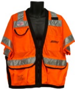
CLASS III ALL-MESH 10-POCKET SURVEYORS VESTS ZIPPER CLOSURE WITH MAP POCKET ANSI / ISEA (107-2004) ANSI CLASS III 10-POCKET SURVEYORS SAFETY VEST WITH MAP POCKET; ALL-MESH, NFPA 701 *