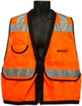
CLASS II ALL-MESH 10-POCKET SURVEYORS VESTS ZIPPER CLOSURE WITH MAP POCKET ANSI / ISEA (107-2004) ANSI CLASS II 10-POCKET SURVEYORS SAFETY VEST WITH MAP POCKET; ALL-MESH, NFPA 701 *