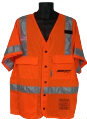
CLASS III FABRIC UPPER / MESH LOWER FRONT ALL-MESH BACK VESTS SNAP CLOSURE ANSI / ISEA (107-2004) ANSI CLASS III SAFETY VEST; FABRIC UPPER / MESH LOWER FRONT - ALL-MESH BACK, NFPA 701 *