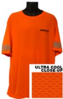
CLASS E 100% POLYESTER ULTRA COOL MESH SHORT SLEEVE T-SHIRTS WITH SEGMENTED REFLECTIVE TAPE

ANSI / ISEA (107-2004) ANSI CLASS E 100% POLYESTER ULTRA COOL MESH T-SHIRT, SHORT SLEEVES, ORANGE; WITH SEGMENTED REFLECTIVE TRIM; NFPA 701 *