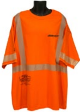
CLASS III 6OZ LIGHT-WEIGHT INDURA SOFT JERSEY FR SHORT SLEEVE T-SHIRT WITHOUT POCKET ANSI STYLE CLASS III 6OZ LIGHT-WEIGHT INDURA SOFT JERSEY FR SHORT SLEEVE T-SHIRT WITHOUT POCKET; ASTM F1506 AND NFPA 70E; ORANGE