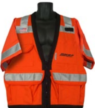
CLASS III 7OZ LIGHT WEIGHT INDURA ULTRA SOFT FR 10 POCKET SURVEYORS VEST ANSI STYLE CLASS II 7OZ LIGHT WEIGHT INDURA ULTRA SOFT FR HOT WORK & ELECTRICAL RATED SAFETY VEST; ASTM F1506 AND NFPA 70E; ORANGE; ZIPPER CLOSURE