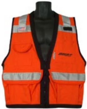
CLASS II 7OZ LIGHT WEIGHT INDURA ULTRA SOFT FR 10 POCKET SURVEYORS VEST ANSI STYLE CLASS II 7OZ LIGHT WEIGHT INDURA ULTRA SOFT FR HOT WORK & ELECTRICAL RATED SAFETY VEST; ASTM F1506 AND NFPA 70E; ORANGE; ZIPPER CLOSURE